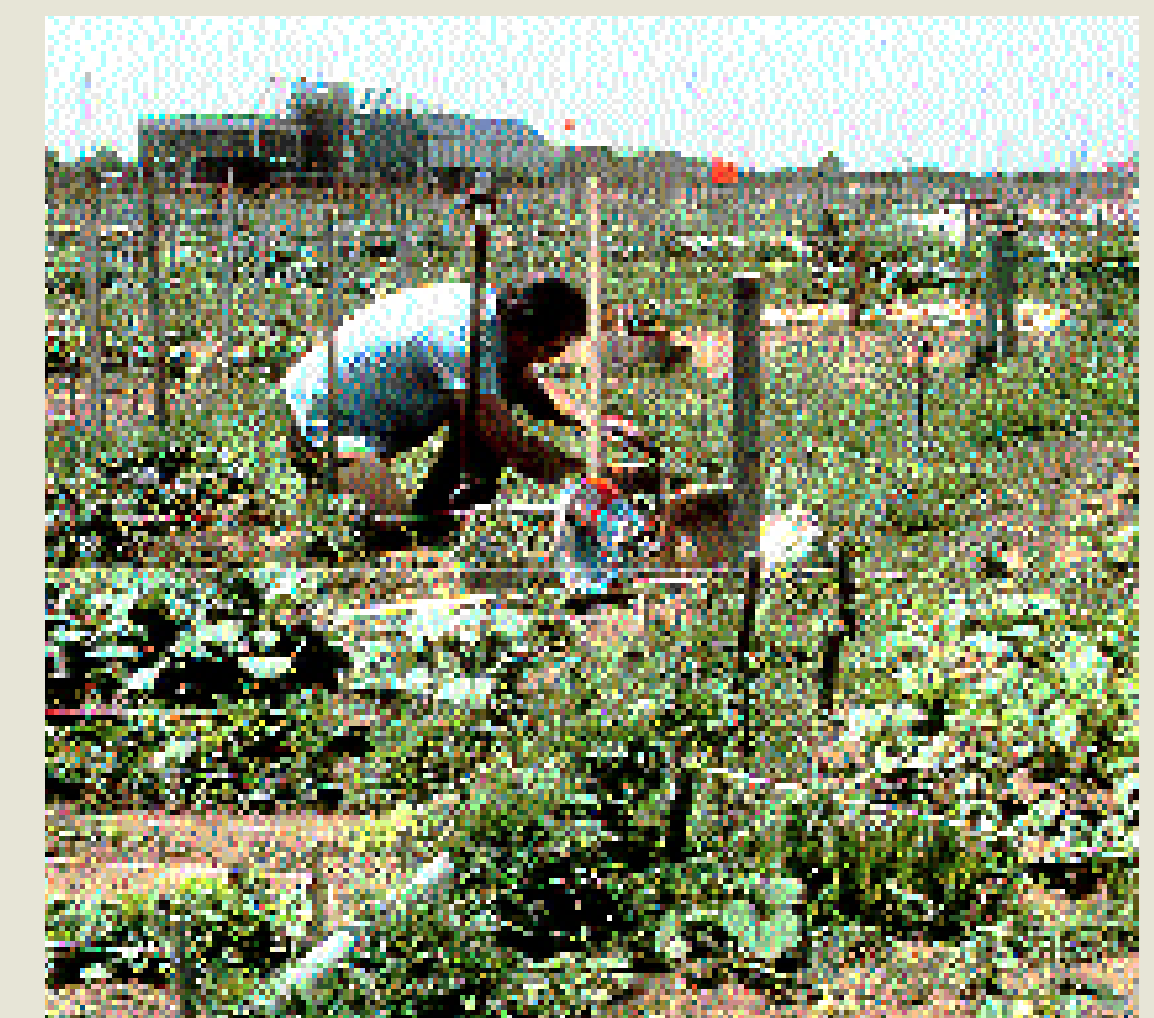
Gardening at the Community Garden