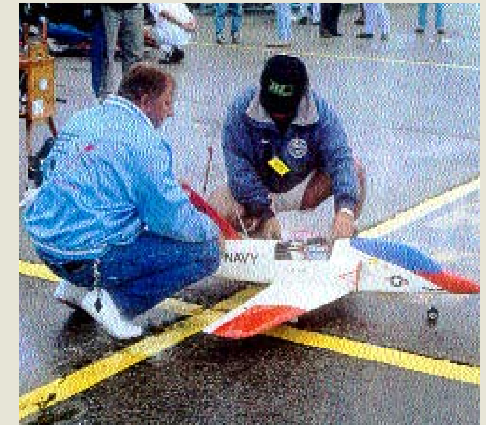
Model plane enthusiasts