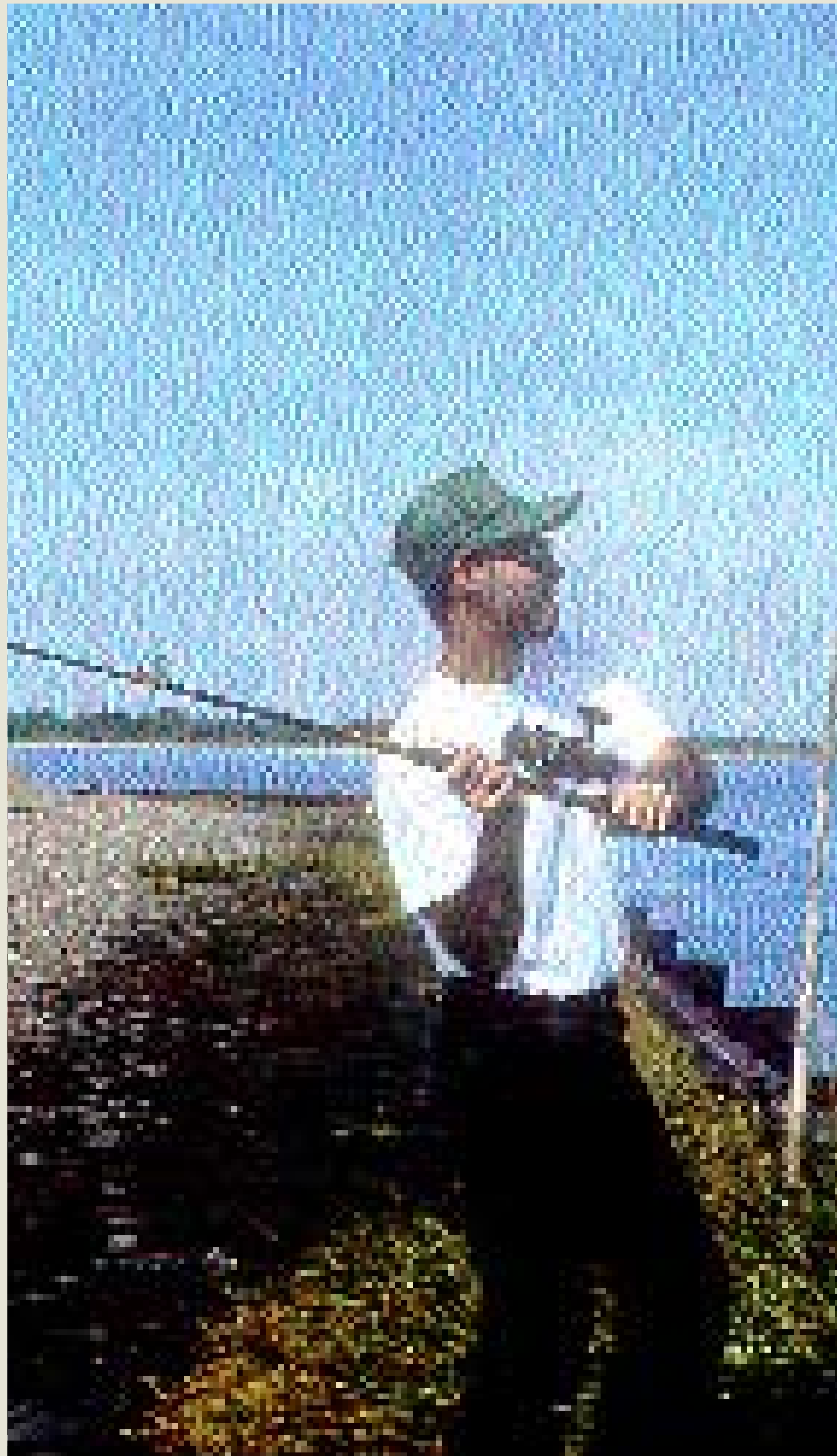
Fisherman at Raptor Point.