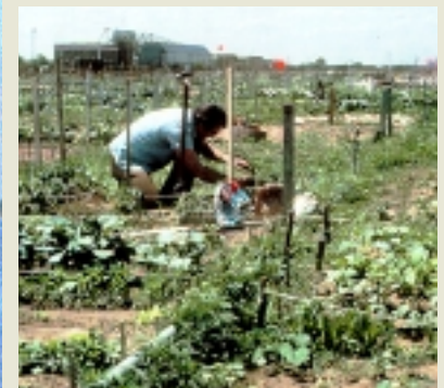
Gardening at the Community Garden