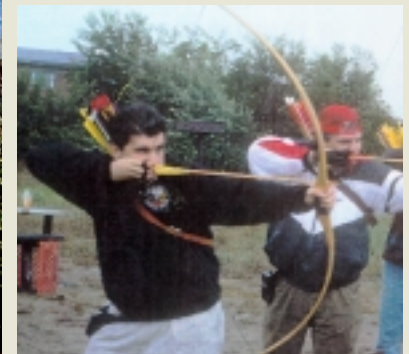
Archers practicing at Ranger Road