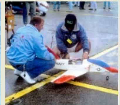
Model plane enthusiasts