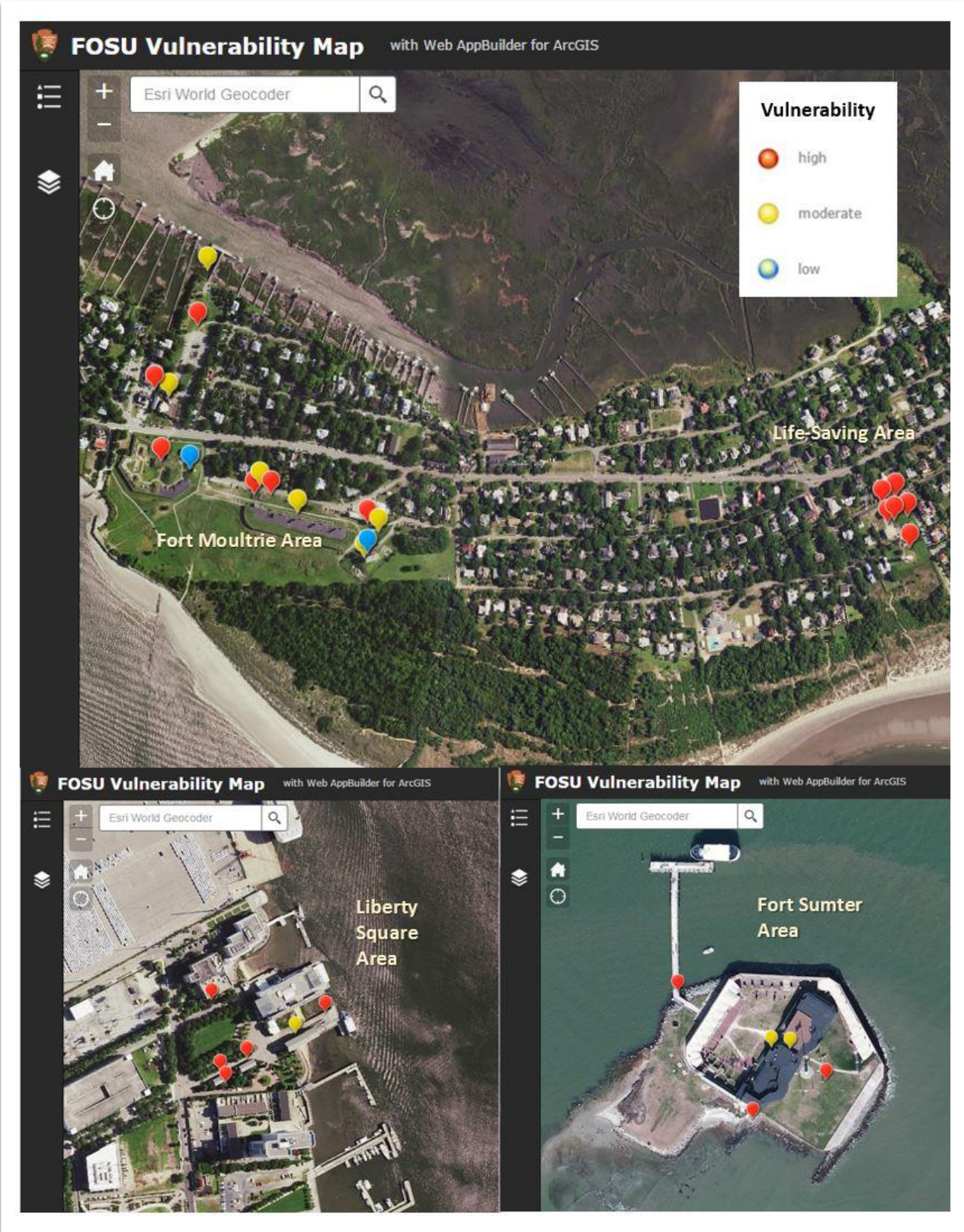
Figure 2. Mapped vulnerability results for FOSU assets.