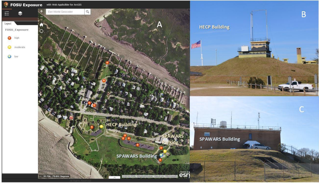
Figure 1. A) Exposure results of the Fort Moultrie area of FOSU. B/C) Two lower exposure structures at Fort Moultrie (due to higher elevations).