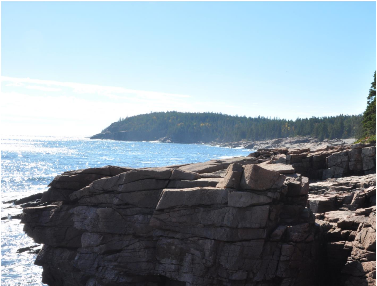
Figure 2. Example of rocky shoreline at ACAD.

Unlike many coastal parks along the East Coast, much of the shoreline at ACAD is comprised of erosion-resistant granite bedrock or boulders (Figure 2). Sand beaches are relatively rare and are typically only present in protected coves (i.e., Sand Beach). Due to this rocky coastline, the erosion risk is relatively low at the park. Therefore, the coastal proximity buffer at ACAD represents areas near the shoreline that may be affected by other coastal hazards such as wave action and cliff instability.